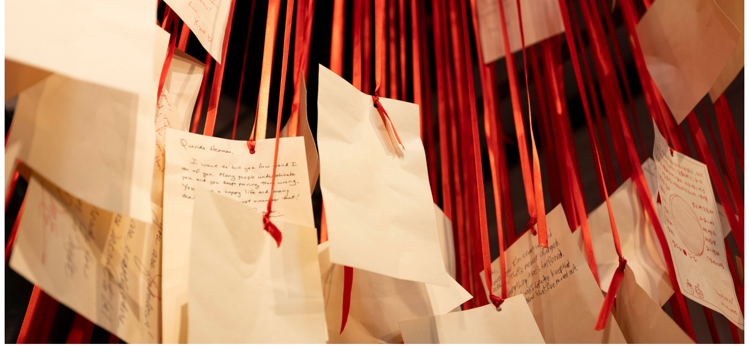
Love Letters by Lucas Rougeux, 2023 Post-Grad, Photography by Catie Leonard