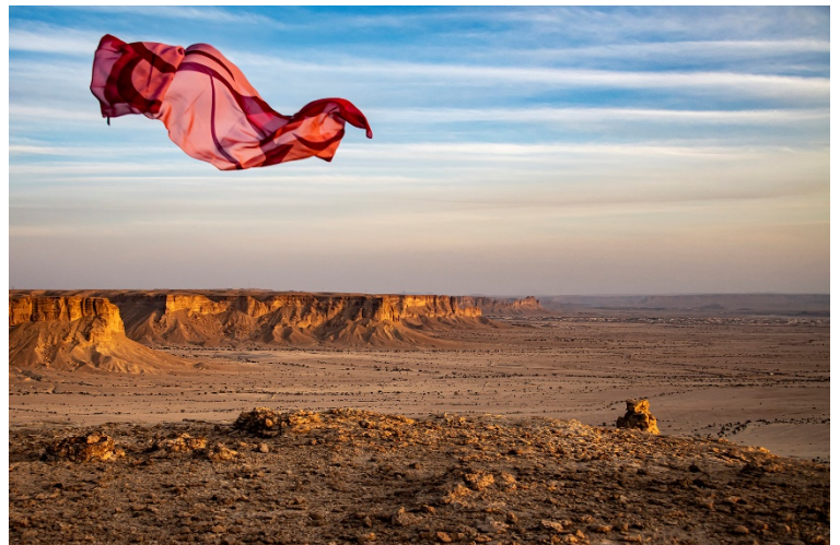
Rania Razek, Letting Go , 2019. Lustre print on bamboo.

*Artists showing exclusively in the digital online catalogue.