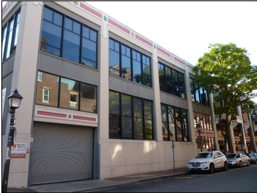
loading dock, facing southeast