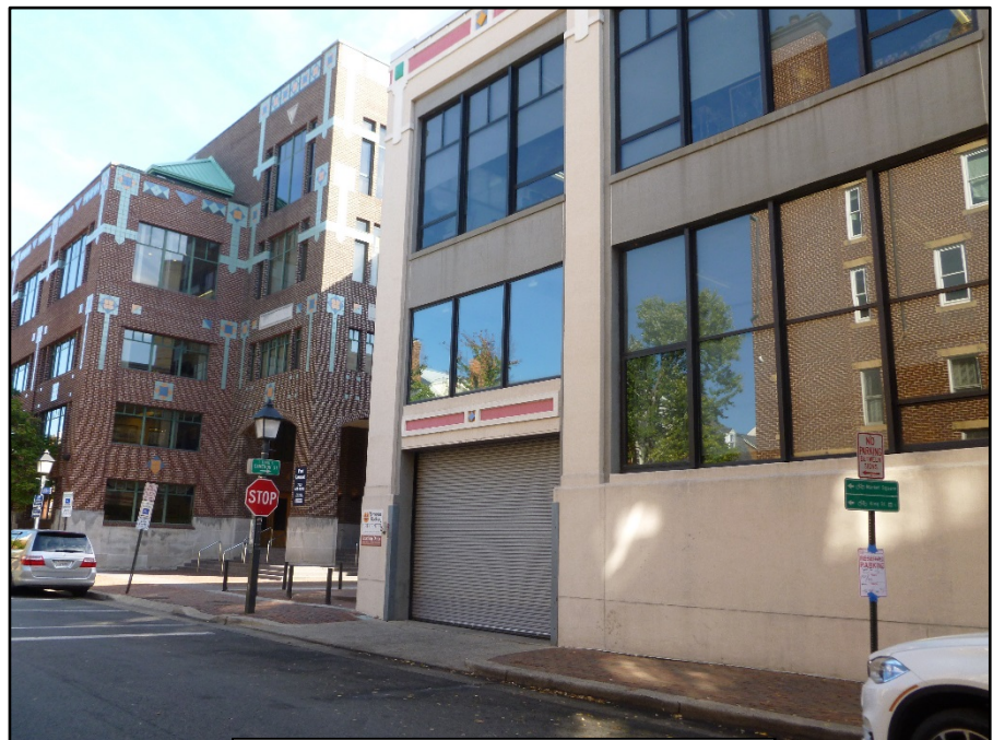
loading dock, facing northeast